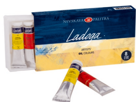
Oil colours set, 8 x 18 ml