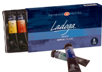
Acrylic colours set, 8 colours of 18 ml