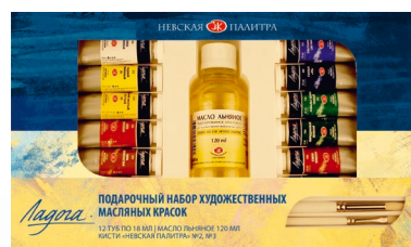
Artists' oil colours gift set 12 colours in 18 ml tubes, linseed oil 120 ml, brush bristle long handle flat №2 and round №3