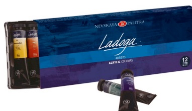
Acrylic colours set, 12 colours of 18 ml