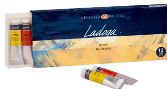
Oil colours set, 12 x 18 ml