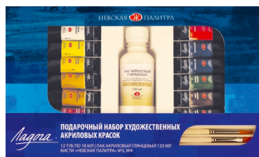
Artists' acrylic colours gift set 12 colours in 18 ml tubes, gloss acrylic varnish 120 ml, brush synthetic long handle flat №4 and round №3