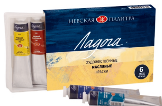
Oil colours set, 6 x 46 ml