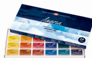
Watercolours set, 24 colours in pans of 2.5 ml, cardboard box