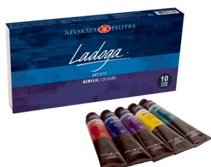
Acrylic colours set, 10 colours of 46 ml