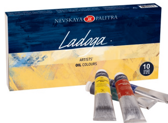
Oil colours set, 10 x 46 ml